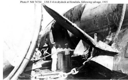
Photographed in 1913-15, in Honolulu drydock after salvage, and implosion hole inspection