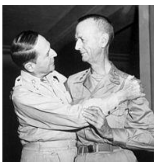
Wainwright ordering the surrender of the Philippines while being watched by a Japanese censor & Wainwright (right) and MacArthur greet, August 1945