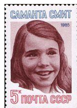
1985 USSR Stamp